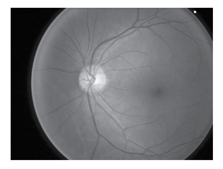
Figure 1. Normal Retinal Photograph

These investigations provide further clues to the early changes that may occur in heart disease, and the link between disease of the small blood vessels (eye) and larger arteries (heart). The MESA-Eye team is now investigating how eye changes may provide information on future risk of heart disease, stroke and other conditions.