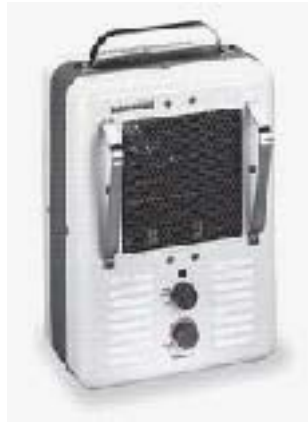
Electric space heater