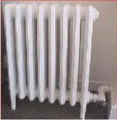
Steam or hot water radiator