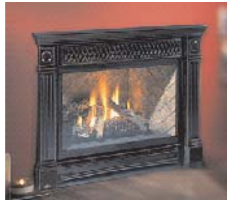
Gas space heater, gas fireplace