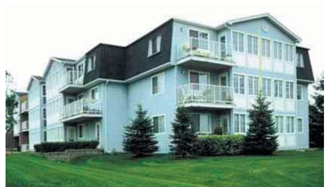
Low rise apartment/condo/coop