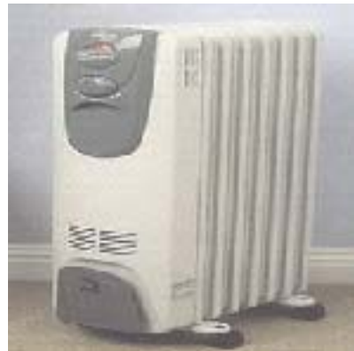
Electric space heater, oil filled