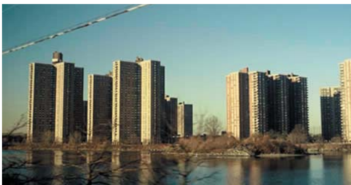
High rise apartment/condo/coop