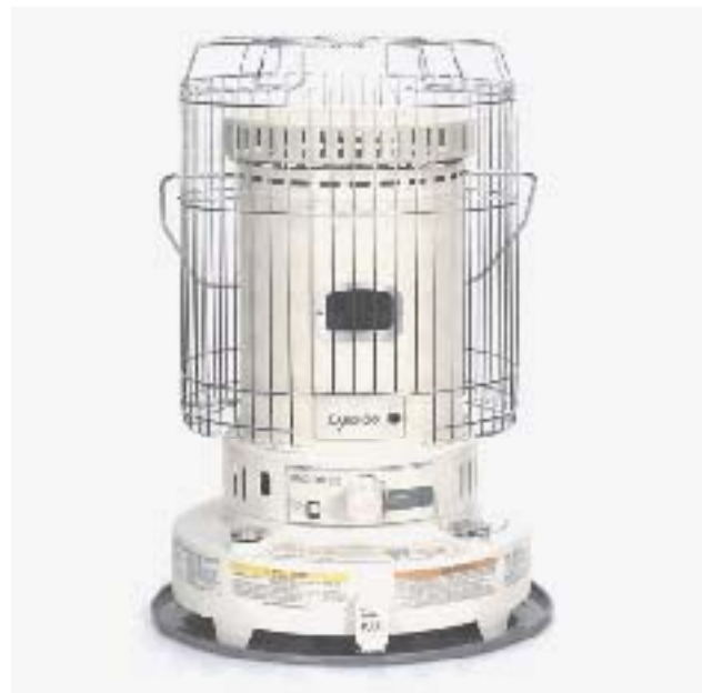
Kerosene space heater