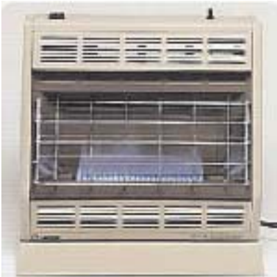
Gas space heater, unvented