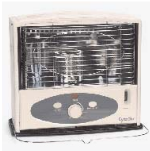
Kerosene space heater