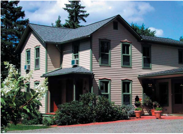
Single family, free standing