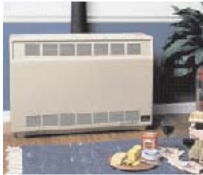
Gas space heater, vented