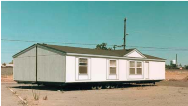
Manufactured or mobile home