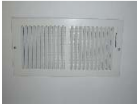
Forced air vent