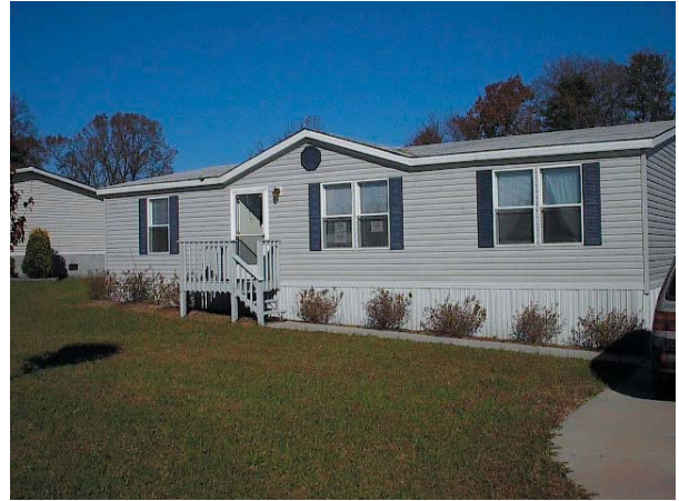
Manufactured or mobile home